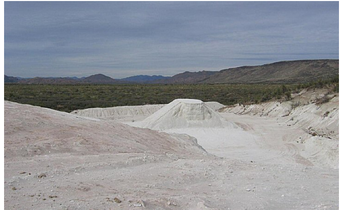
Above: the Lyle clay pit.

The one-day post-meeting trip will depart from Scottsdale on May 5. Points of interest include the Imerys Group pearlite deposit near Superior and the National Gypsum mining operation between Winkleman and Mammoth, the Superstition Mountains, the ASARCO Ray Mine, the Inspiration/Miami Mining District, the town of Superior at the base of Apache Leap, and the Resolution Copper deposit. Registration cost for this trip is $55 and includes transport by modern air-conditioned motor coach, and an informal lunch in the Miami-Globe area.