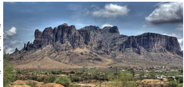
Below: Superstition Mountains.

You can see a lot more information on these trips on the AGS website ( arizonageologicalsoc.org ). Register online at http://geologyofindustrialminerals.org/registration/register