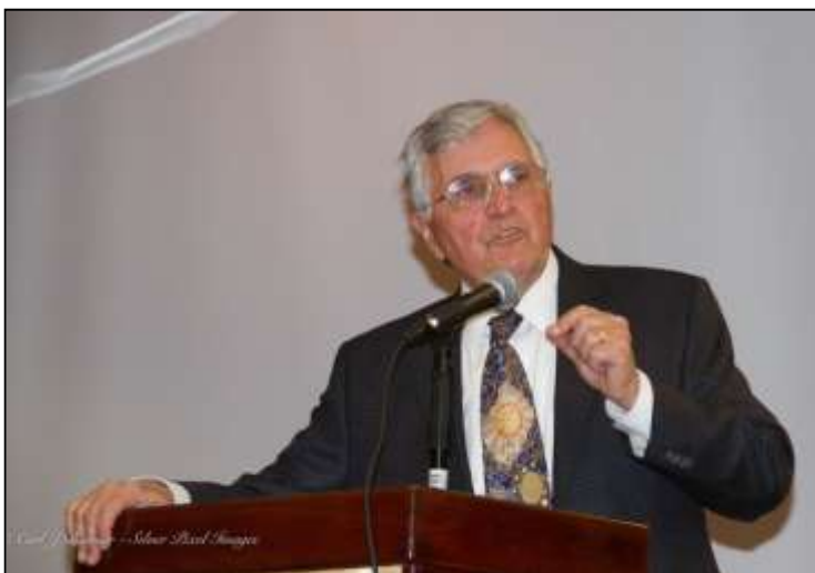
Senator Harrison Schmitt Describes His Visit to the Valley of Taurus-Littrow

Senator Schmitt concluded his remarks with a brief observation that lunar resources make the Moon an ideal stepping stone for future human exploration, utilization and settlement of space.