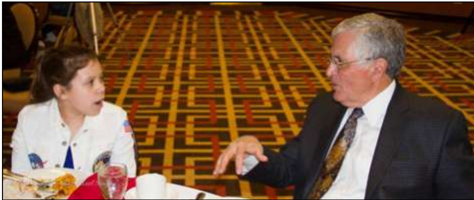
Harrison Schmitt discusses Apollo 17 Mission with a young, aspiring astronaut