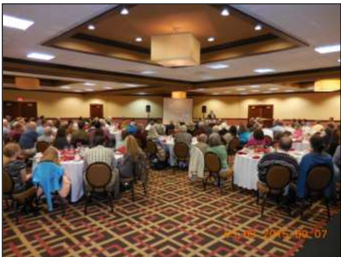
Audience Listens to Presentation on Lunar Geology

The Arizona Geological Society thanks Senator Schmitt for an evening that we will never forget. Many of the attendees made this event a family affair by bringing their children to meet and hear this important figure in America's space program.