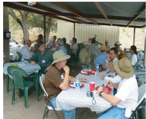
Enjoying lunch at the Rosemont ranch