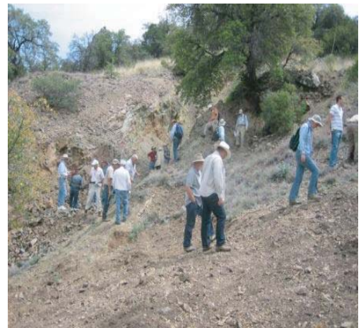
Viewing the outcrops of the deposit within the proposed pit boundary