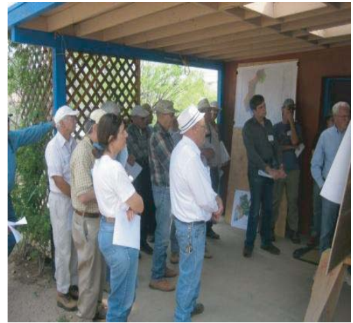
Discussing the property and the area's geologic setting