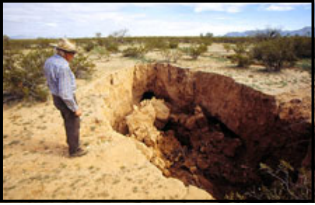
A Cochise County earth fissure that is being monitored by the EFC.

Watch for additional details in future issues of the AGS Newsletter.