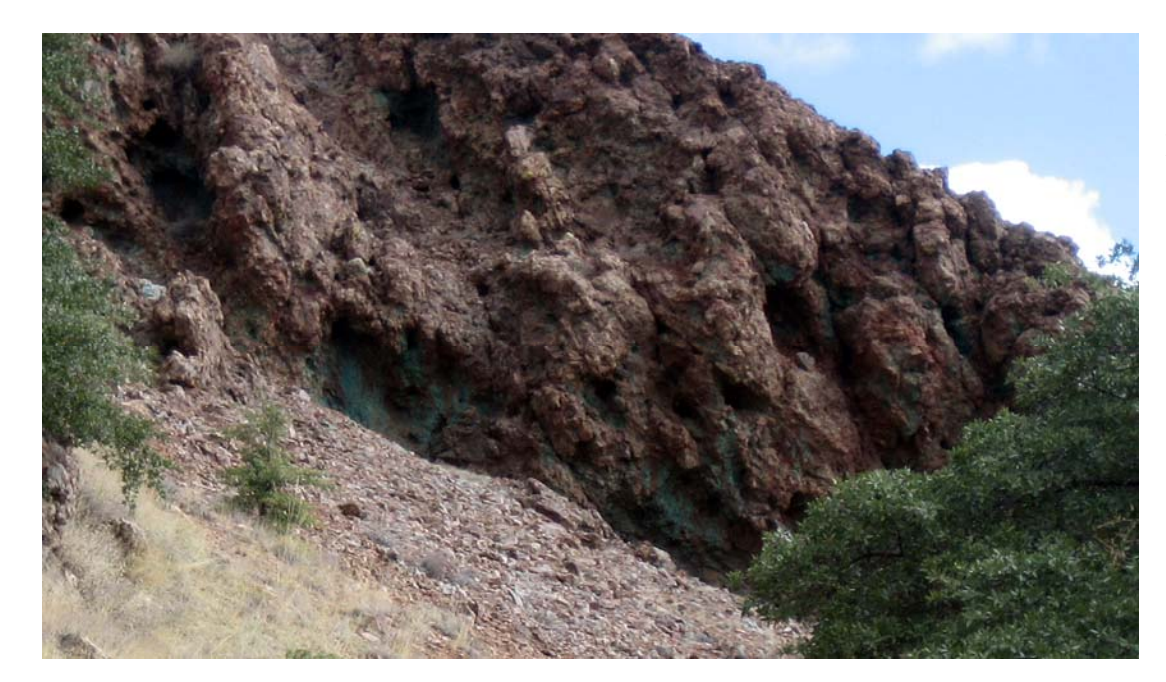
Left: Malachite visible in outcrop.

The Rosemont Copper Project will be the subject of the August dinner meeting presentation. Here are a few photos to whet your appetite!