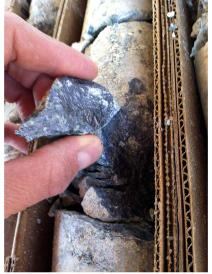
Above: Visible molybdenum in core sample.