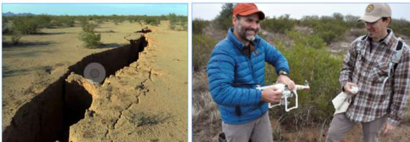
Figure 1. Open segment of 2-mile long, N-S oriented earth fissure whose north half formed between Mar. 2013 and Dec. 2014; the southern half post-dates Dec. 2014. Fissure width ranges from inches to 10 feet and up to 30 feet deep. Note the extensive tension fractures outboard of the fissure.

Earth fissure news: AZGS geoscientists Joe Cook and Brian Gootee documented a fresh, two-mile long earth fissure in southern Pinal County (Figure 1). Using a drone operated by Brian Gootee, they captured images and two marvelous drone videos of the feature. See our Arizona Geology Blog for a short report with links to the videos. http://arizonageology.blogspot.com/