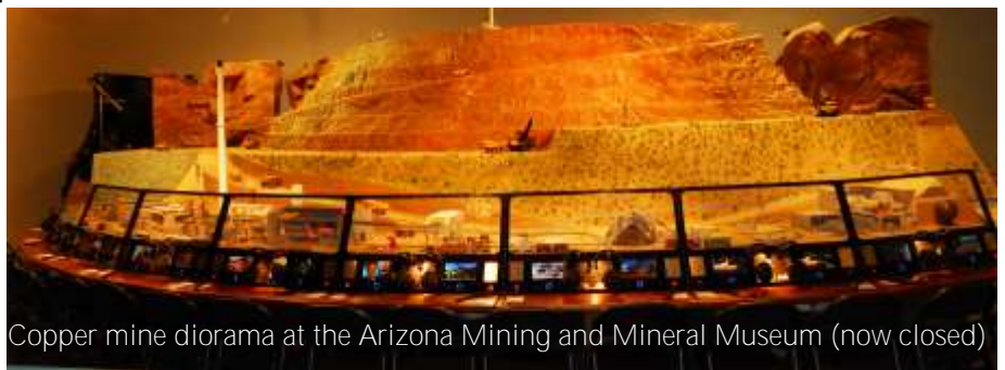
Copper mine diorama at the Arizona Mining and Mineral Museum (now closed)