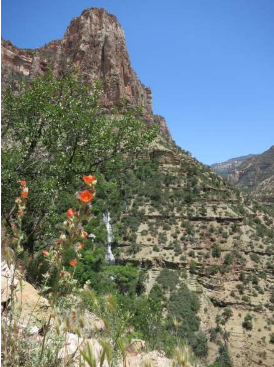
Figure 2. Roaring Springs

which is present for much of the year, recharges the aquifer slowly, and has a longer residence time than flashier, summer monsoonal precipitation. Implications of this study include prediction of aquifer behavior during a changing climate and assist with efforts to develop a more comprehensive protection plan for the karstic R aquifer.